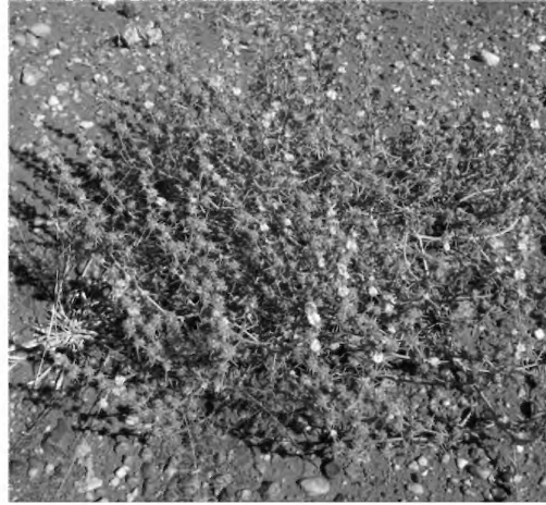
Fig. 3. Salsola australis subsp. Strobilifera , showing the fruits aggregated into cones on short lateral branches — R.J. Chinnock 10020.

another paper on the Californian tumbleweed ( Salsola sect. Kali ) by Ayers et al. (2009) refers to S. kali subsp. austroriparica but makes no reference to either S. australis or the paper by Hrusa & Gaskin (2008). Presumably this was the result of a longer delay before publication, as the Ayers paper was submitted in late 2007.